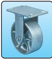
SS: Semi Steel