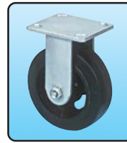
MR: Moldon Rubber