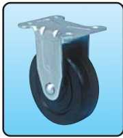
HR: Hard Rubber