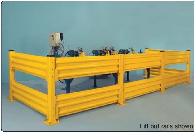
Lift out rails shown