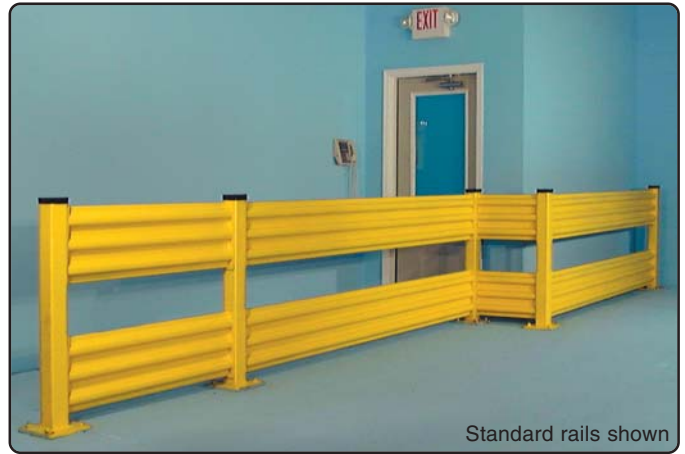
Standard rails shown

jescogARD acts as both a visual and physical barrier to help protect people and property such as aisles, docks, conveyors and other equipment. Designed and tested to stop a 10,000 lbs load impacting at 4 mph from breaking through. All hardware is included and is shipped in crates. Painted safety yellow.