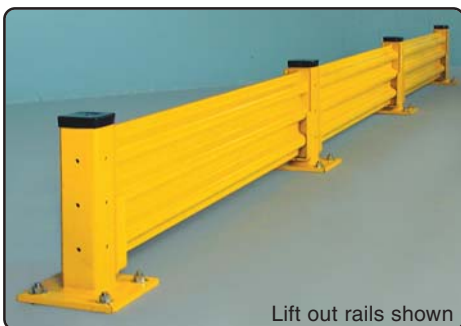
Lift out rails shown