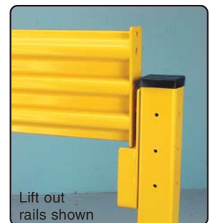
Lift out rails shown

Rails: 11 gauge formed, 3 ribs Posts: 4" x 4" x 1/4" square tube Base plates: 10" x 10" x 5/8" Anchors: (4) 3/4" x 6 1/4" long