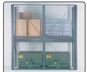
Double hinge door