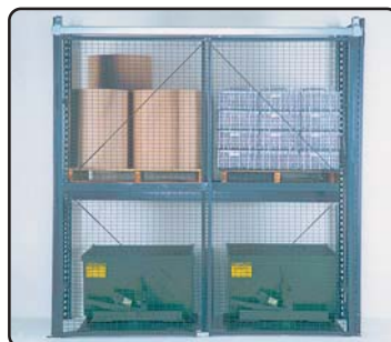
Double slide door